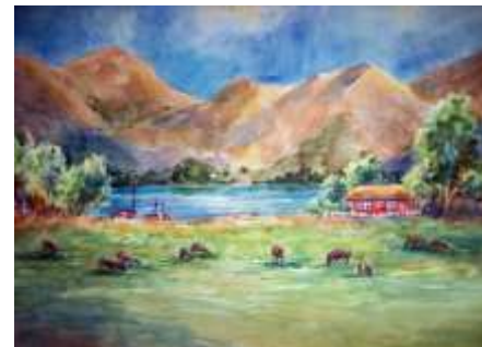
“The Lake District” by Sandy Mart

A collection of impressionistic watercolors including landscapes, florals and city scenes. Marge Tull and Sandy Mart have taken workshops and classes together for many years. Marge’s paintings reflect her loose, “leave something to the imagination” style and Sandy is showing her “Impressions of England”. “Light in Glass” by Daryle Ryder has worked with fused glass for 14 years and worked with a variety of artists and different types of glass styles. In recent work she has been working with cast glass and different types of slumping techniques with thicker glass. This has led to a new styles and variety in the end result, which include sculptures, bowls and plates. Color and depth are big players in her latest work.