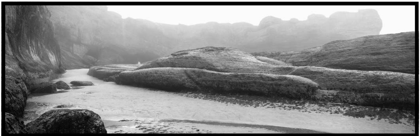
Carved By The Sea - Charles Search

"Recent Black and White Landscapes" by Walt O'Brien and "Atmospherics in the Landscape" by Charles Search Plus work from members of the Emerald Art Center.