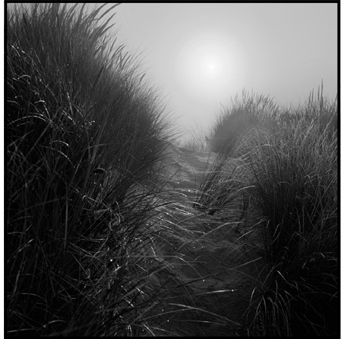
Trail To The Sun - Walt O'Brien