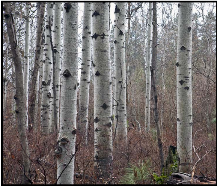
Aspens - Deigh Bates

"Simple Forms" photography by Deigh Bates