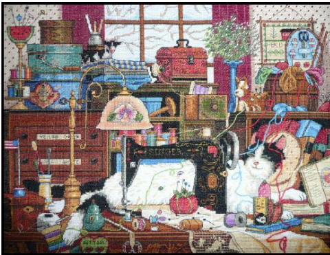
Barb Mitchell, "Counted Cross Stitch Cat"

A chapter of The Embroiderers' Guild of America (EGA), will feature a variety of embroidery types, including needlepoint, counted cross stitch, crewel, appliqué and beadwork. Many of the pieces have taken hundreds of hours to complete using complex designs and dozens of different types of stitches and needlework techniques. These amazing and beautiful pieces of textile art utilize a variety of fibers, such as dyed threads, silks, metals, cotton and wool, and are stitched on fabrics such as congress cloth, aida cloth and various linens. Also featured at the show will be an EGA traveling exhibit entitled, "The Lincourt Hearts," so-named for Marnie Lincourt of Little Rock, Arkansas, who created the heart design and solicited 40 expert needleworkers from across the country to stitch them utilizing their own unique techniques. Lincourt's intent was to generate an exhibit that would showcase the varied embroidery methods that can stem from a single design. Originally on display at EGA's 2000 Region Seminar in Shreveport, Louisiana, The Lincourt Hearts have traveled extensively throughout Arkansas, Louisiana, Oklahoma and Texas, and were recently exhibited at an arts festival attended by over 100,000 people. Cascade Stitchers and the parent EGA are non-profit educational organizations offering study and preservation of the heritage and art of embroidery. For more information about Cascade Stitchers or EGA, contact Ann Simas, Community Relations Liaison, at CascadeEGA@gmail.com .