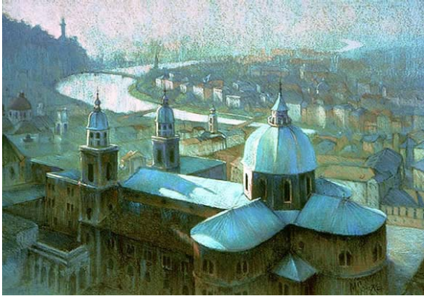
"Salzburg Afternoon" 30 x 39 pastel