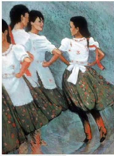
"Hungarian Dances" 24 x 18 pastel