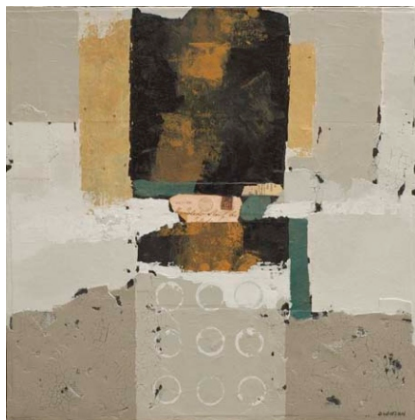
"Spirit" Acrylic, collage on canvas support 18" x 18"