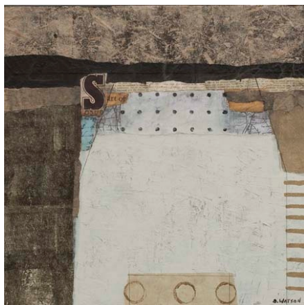
"The Secret" Acrylic, collage on canvas 16" x 16"