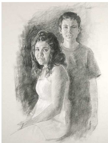
"Study for Commission" 18x24 Charcoal