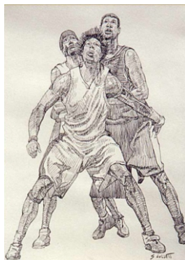
"Basketball Players" 11x18 Pencil

To see more of Sam's work visit www.SamCollettFineArt.com