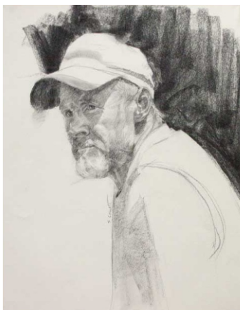
"Kurt" 18x25 Charcoal

EAC CANCELLATION: We reserve the right to cancel a workshop at any time for good cause: lack of sign-ups, illness of instructor, extreme weather conditions, etc. If we do cancel a workshop we will refund your entire payment. We will not be responsible for any other expense you may incur.