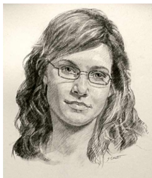
"Emily" 11x14 Charcoal