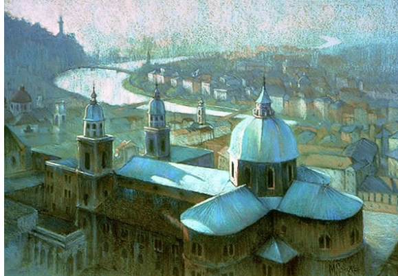
"Salzburg Afternoon" 30" x 39" pastel