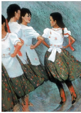
"Hungarian Dances" 24" x 18" Pastel