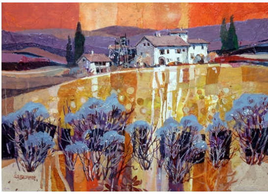
"Tuscany Memory", 11" x 15", W/C Collage