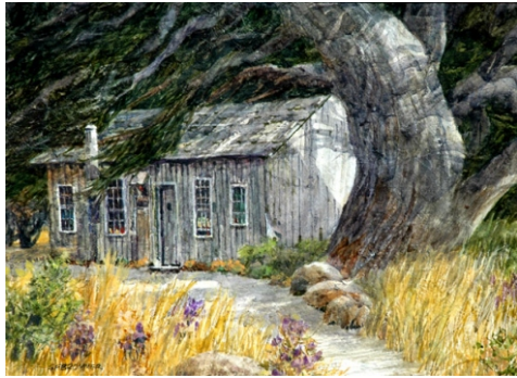
"The Whalers' Cabin", 15" x 20", W/C Collage